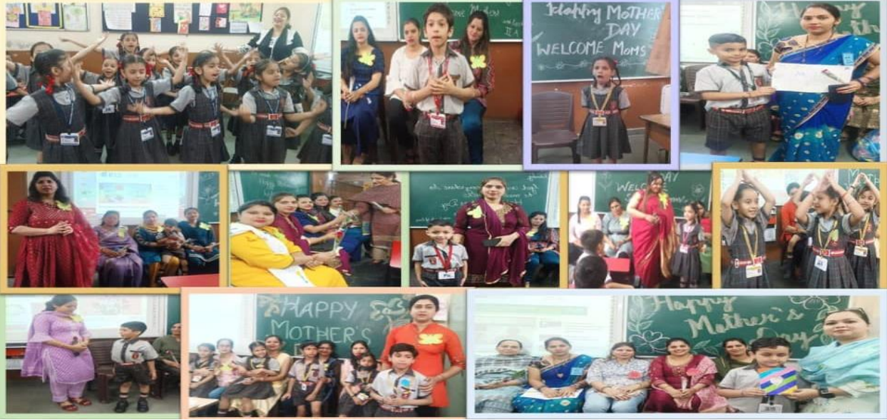
Card Making & Handout activity held on Mother's Day

"There is no role in life that is more essential than that of motherhood." Celebration of Mother's Day in School Premises