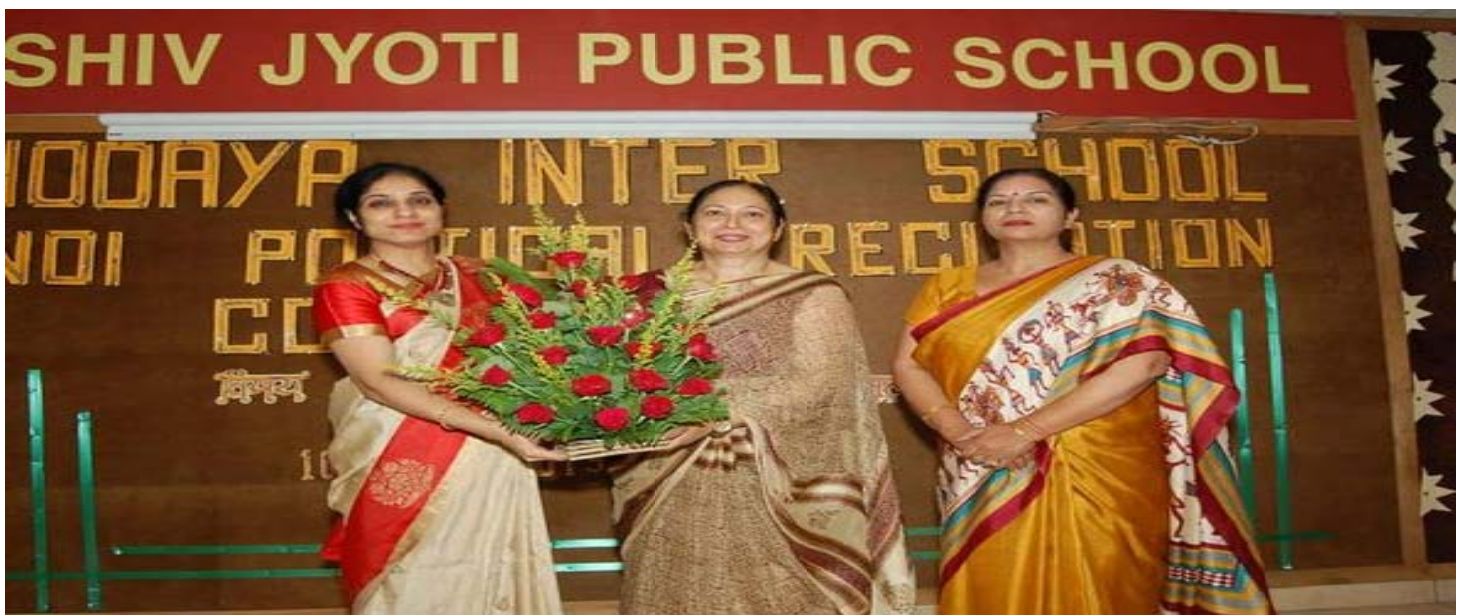
Hoisting district level Sahodaya Inter School Hindi Poetical Recitation Competition

The event was encouraged with the zealous participation of Students from 45 schools under the aegis of Jalandhar Sahodaya Complex.